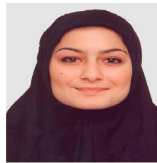
Smiling not permitted as it distorts the features