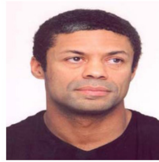
Not looking at camera