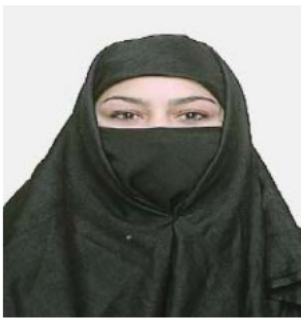
Features are covered up