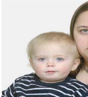
Contains more than one person