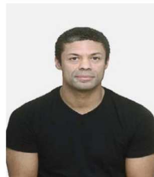
Too far from camera