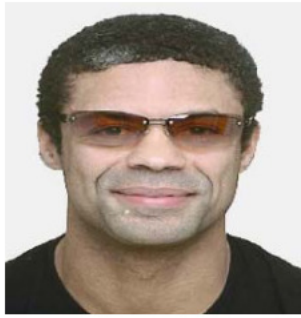
Sunglasses cover eyes