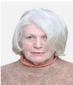
Hair is covering face