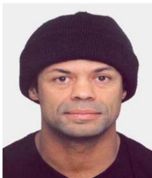
Hats are not permitted