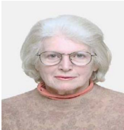
(Head coverings for religious or medical grounds only are allowed)