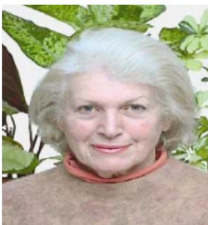
Background is not light grey or cream