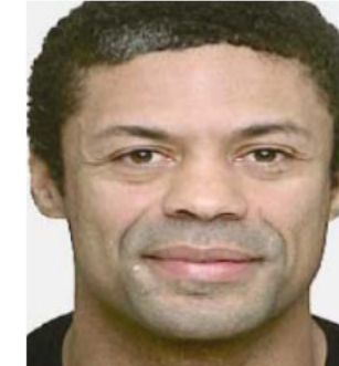
Too close to camera