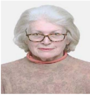
Glasses cover eyes